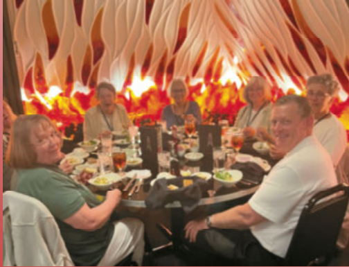
Nonsense at the Fireside