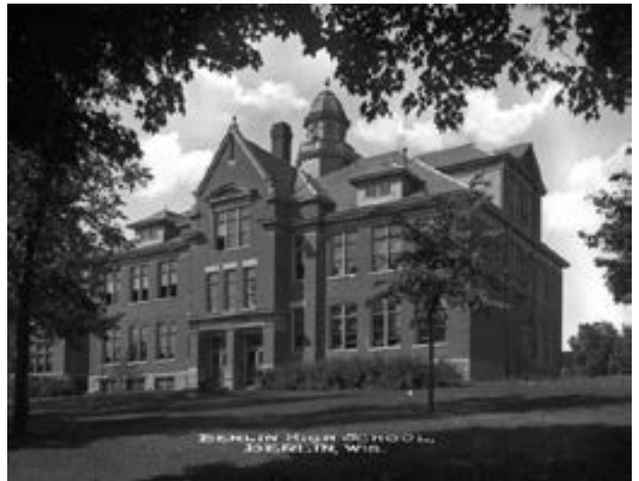
Old Berlin High School Photograph