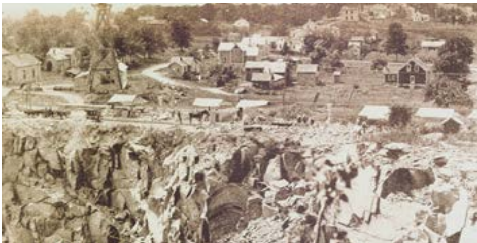
Berlin Quarry, Source: Berlin Area Historical Society