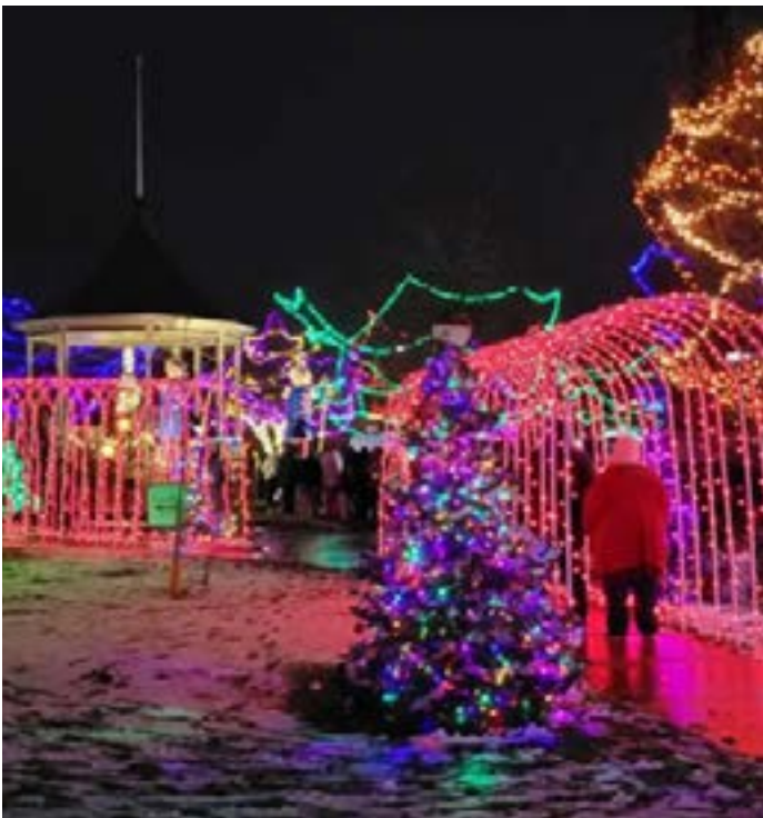
Christmas in the Park