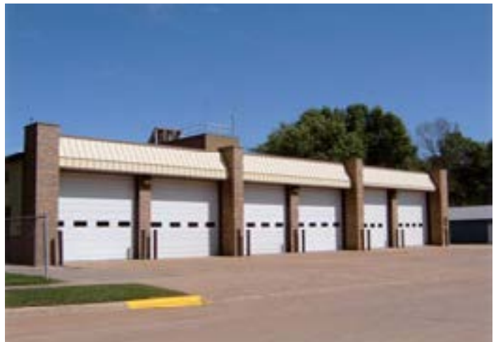
Berlin Fire Department