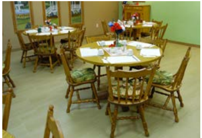
Berlin Senior Citizen Center