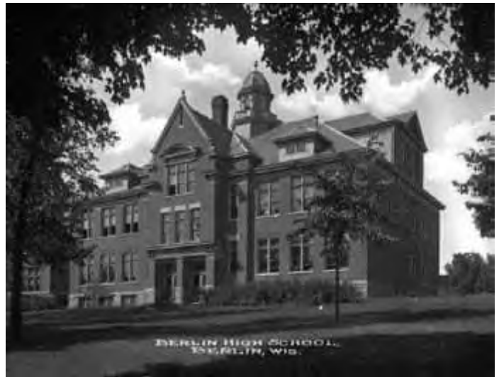
Old Berlin High School Photograph