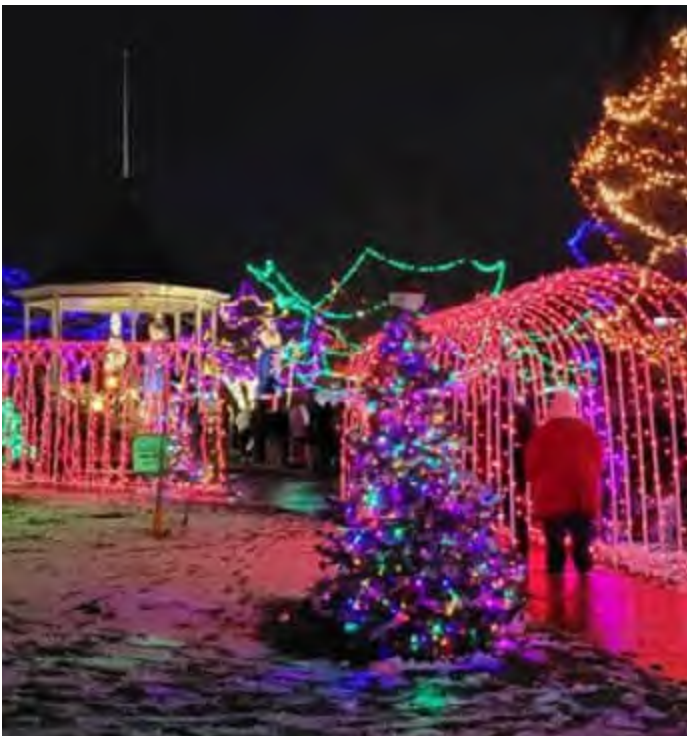
Christmas in the Park