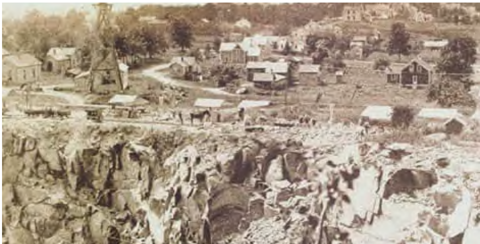
Berlin Quarry