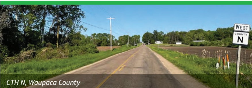
CTH N, Waupaca County