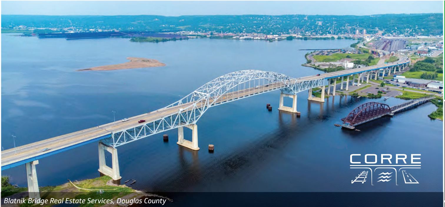
Blatnik Bridge Real Estate Services, Douglas County